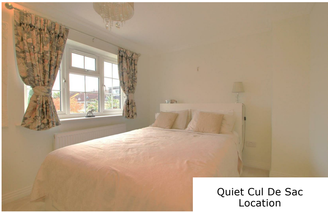
Quiet Cul De Sac Location